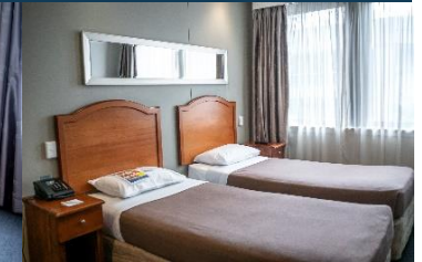
STANDARD TWIN ROOM

Great Southern Hotel Sydney is a heritage listed hotel dating back to 1854 located in the vibrant heart of the city. Keeping the heritage façade of the “original Great Southern Hotel”, the hotel combines many charms of the old building with modern conveniences. With easy access to the city’s entertainment, shopping and tourist attractions. It is an ideal location for business and holiday travellers seeking comfort and convenience.