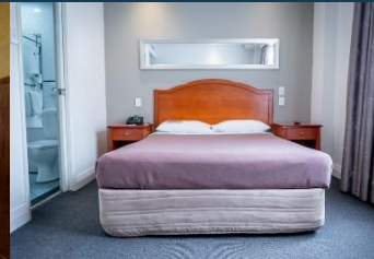
STANDARD QUEEN ROOM